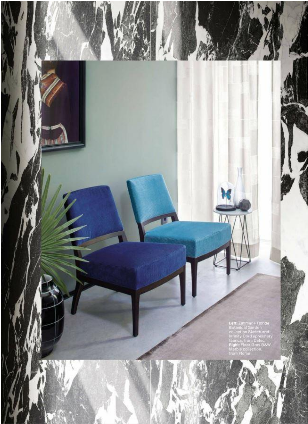
Left: Zimmer + Rohde Botanical Garden collection Sketch and Infinity Cord upholstery fabrics, from Ceteo Right: Floor Gres B&W Marble collection, from Florim