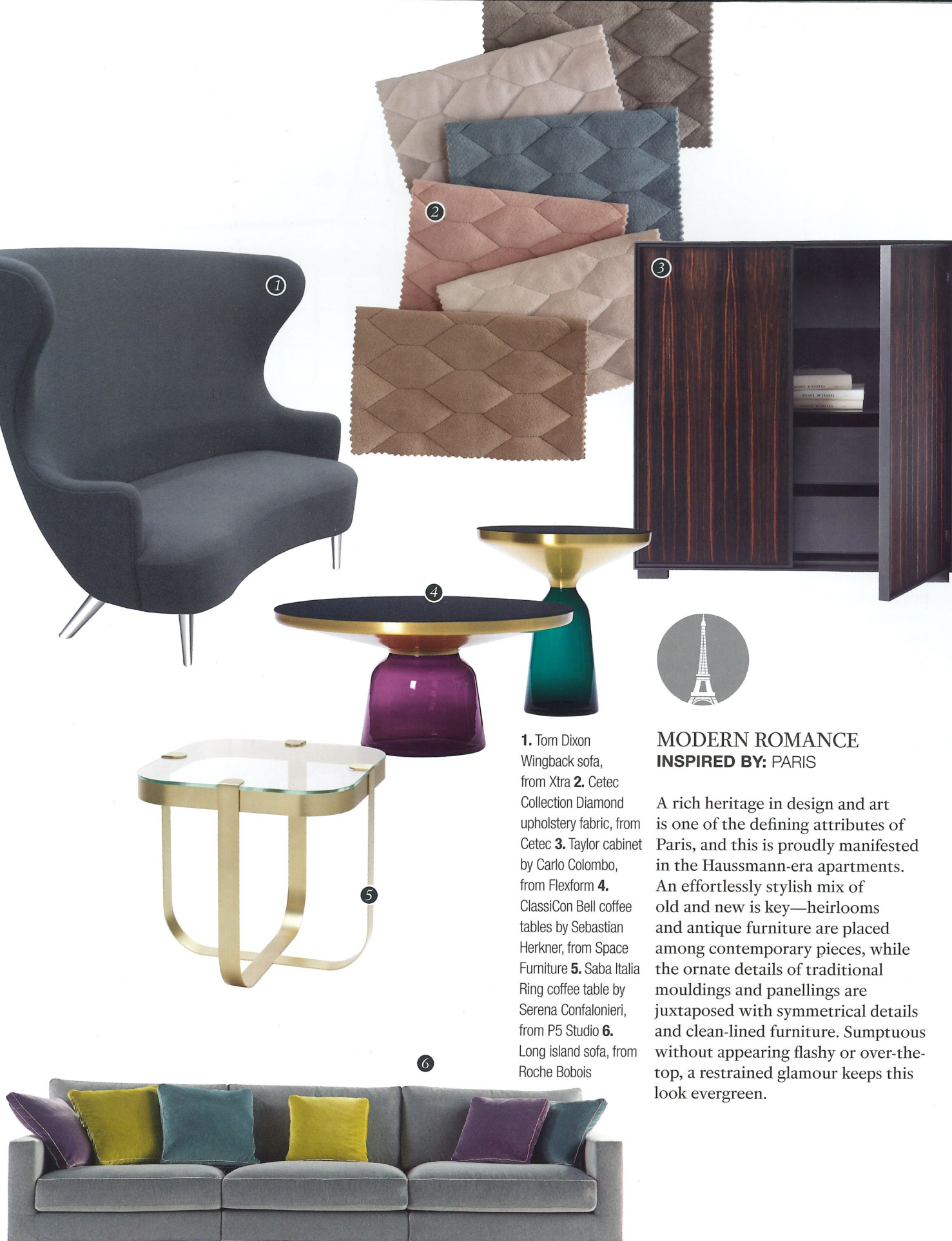
1. Tom Dixon Wingback sofa, from Xtra 2. Cetec Collection Diamond upholstery fabric, from Cetec 3. Taylor cabinet by Carlo Colombo, from Flexform 4. ClassiCon Bell coffee tables by Sebastian Herkner, from Space Furniture 5. Saba Italia Ring coffee table by Serena Confalonieri, from P5 Studio 6. Long island sofa, from Roche Bobois